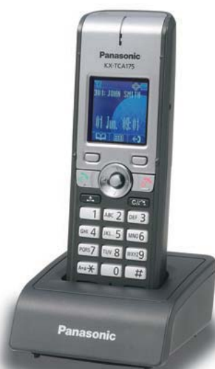
KX-TCA175 Standard Model