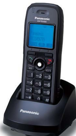
KX-TCA355 Tough Type Model