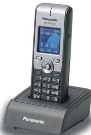
KX-TCA275 Compact Business Model