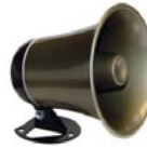
One Viking model 25AE Paging Horn included