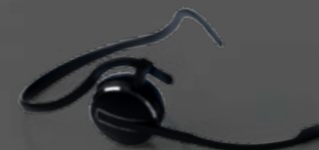
Jabra PRO™ 9460