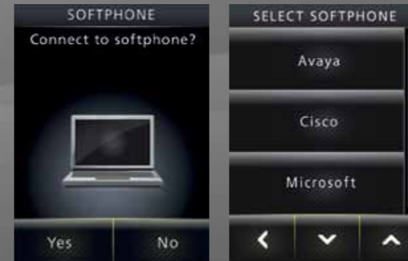
SETTING UP THE HEADSET