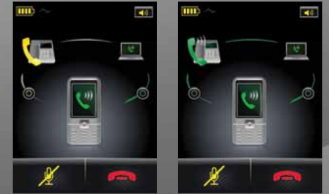
MERGING A CALL

It's easy to get started, too. A SmartSetup wizard on the touch screen guides you through the simple process of connecting phones and choosing preferences to get you started in minutes. Once you're up and running, the screen's colorful icons and intuitive menu system make call-handling a breeze.