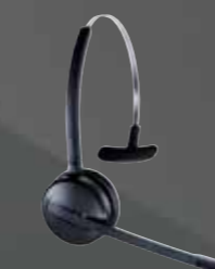
Jabra PRO™ 9450

Jabra PRO™ 9400 Series headsets' stylish, discreet design is adaptable for different wearing styles that ensure a perfect fit all day long. As Unified Communications becomes the norm, users will be wearing their headsets for longer periods, making comfort more important than ever. Choose between a headband, neckband or try the unique Jabra earhook. All wearing styles allow for easy adjustment for use on the left or right ear.