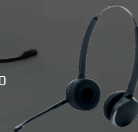
Jabra PRO™ 9465 Duo/ Jabra PRO™ 9460 Duo