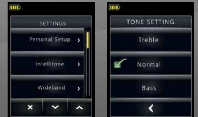
PERSONALIZING THE HEADSET