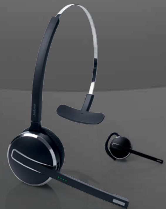
Jabra PRO™ 9470