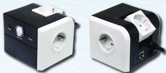
Type C (CEE 7/17) Socket Model: UIS-311