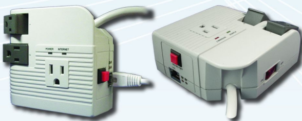
Type B (NEMA 5-15R) Socket Model: UIS-315