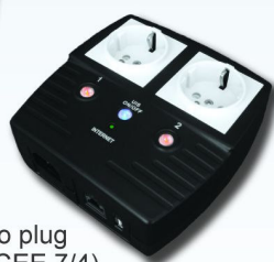
Schuko plug (Type F, CEE 7/4) Model UIS-322f unshuttered Model UIS-323f shuttered