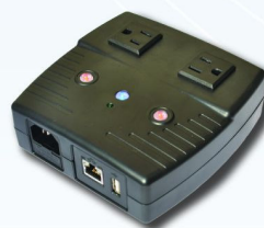
North America plug (Type B, NEMA 5-15R) Model: UIS-322b