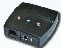
British plug (Type G, BS1383, MS589, SS145) Model: UIS-322g unshuttered Model: UIS-323g shuttered