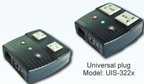
Universal plug Model: UIS-322x