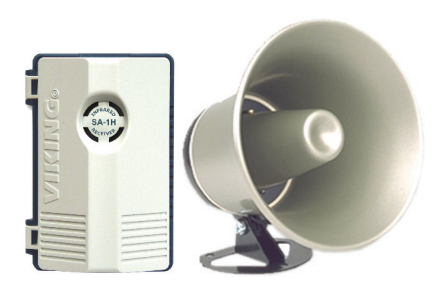
SA-1H Self Amplified Paging Horn with infrared receiver

The VIKING model SA-1H is available for applications in which the self amplified paging system needs to expand beyond the office environment. Applications include workshops, warehouses, industrial space, etc. Mount the paging horn for best sound distribution, and mount the infrared detector (included) where users can easily adjust the paging speaker's volume