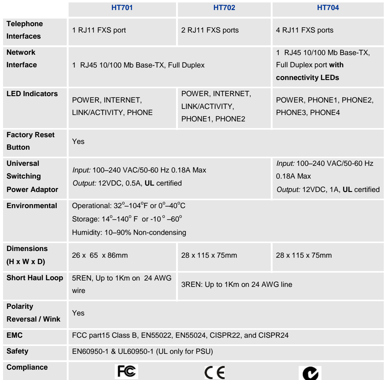
TABLE 5: HT70X HARDWARE AND TECHNICAL SPECIFICATIONS

The table below lists the Hardware and Technical specification of HT70X.