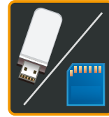
USB & SD